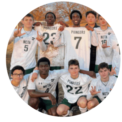
Boys soccer saw much success and brought home the championship!