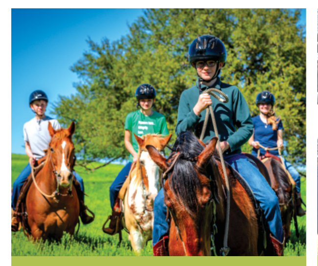
Students gain confidence and responsibility through horseback riding, a beloved part of life at Happy Hill Farm.