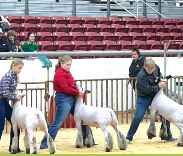
Hard work and dedication on display—FFA students proudly present their prize-winning sheep, showcasing their skills in agriculture and animal care.

IN DECEMBER, Our students shared the spirit of Christmas while giving back to the community on their Choir Tour.